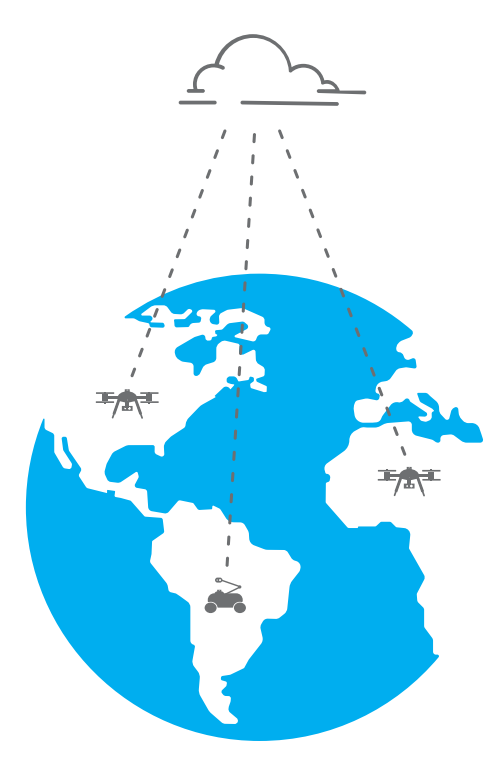
MULTIPLE UAVS & UGVS IN SEVERAL LOCATIONS