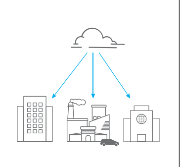
ONE DRONE CAN OPERATE IN SEVERAL LOCATIONS