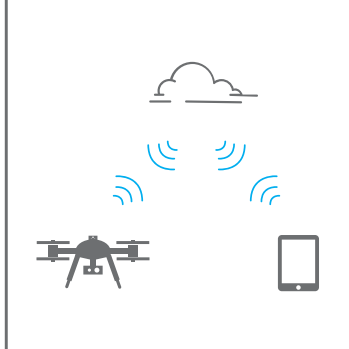
INSTANT DATA UPLOAD TO THE CLOUD